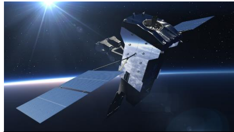
Figure 2: Depiction of SBIRS Missile Warning Satellite

Space-Based Infrared System (SBIRS) is the primary early warning satellite constellation. Made up of six satellites with nuclear-hardened components, SBIRS consists of two hosted sensor payloads in a Highly Elliptical Orbit (HEO) and four dedicated payloads in Geosynchronous Orbit (GEO). 13 SBIRS uses infrared sensors that detect thermal signatures to surveil the Earth, providing vast amounts of data used for missile defense, battlespace awareness, missile warning, and tactical intelligence,, sending raw unprocessed data through five separate downlinks to the ground. The follow-on to the Defense Support Program (DSP) constellation, SBIRS is designed to meet system survivability and endurance requirements, and hardened against a nuclear electro-magnetic blast in space. 14 As of August 4, 2022, all six satellites have been successfully launched into GEO orbit. 16 The original Air Force budget calculations expected SBIRS to cost $5 billion for six satellites– the current numbers place SBIRS at $19.2 billion dollars for six satellites. 17