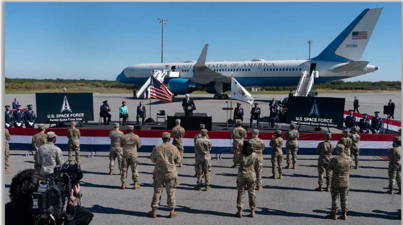
Vice President Mike Pence delivers remarks at a ceremony to re-designate existing U.S. Air Force installations as the first two installations of the United States Space Force at Cape Canaveral Space Force Station on December 9, 2020.

In standing up the newest Armed Service, the U.S. Space Force has achieved a number of significant milestones at a rapid pace: