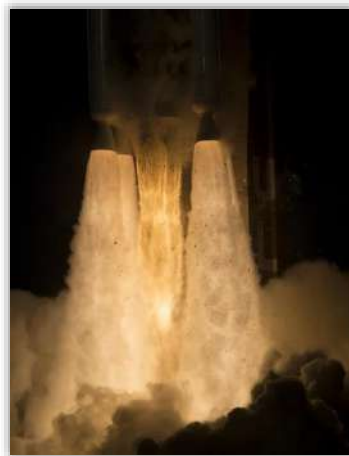
A United Launch Alliance Atlas V rocket with NASA’s Mars 2020 Perseverance rover onboard launches from Cape Canaveral in Florida on Thursday, July 30, 2020.

assembly, advanced space-related power and propulsion capabilities, and orbital debris management among specific areas of interest.