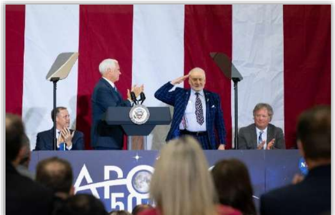
Vice President Mike Pence and Apollo 11 astronaut Buzz Aldrin at the commemoration of the 50 th anniversary of Apollo 11 at NASA's Kennedy Space Center on July 20, 2019.

In addition to elevating public awareness of the mission and achievements of NASA, the National Space Council leveraged the broad array of government expertise at the Departments of State, Defense, Commerce, Transportation, and Energy to strengthen and expand the Nation's civil space enterprise.