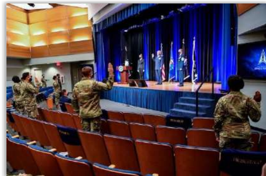
Chief of Space Operations Gen. John W. Raymond administers the oath of office to airmen transferring into the U.S. Space Force during a ceremony at the Pentagon on September 15, 2020.

On February 12, 2020, the President issued an Executive Order on Strengthening National Resilience through Responsible Use of Positioning, Navigation, and Timing Services. This order seeks to protect the national and economic security of the United States and its partners by ensuring reliable and efficient function of the Global Positioning System (GPS) and related critical infrastructure. The United States continues to make GPS services available worldwide as a free service, which has offered immense global value for communications, security, commerce, agriculture, transportation, mobility, weather, and emergency response. However, dependence on this invisible utility and its widespread adoption require protection from disruption and manipulation to ensure national resilience.