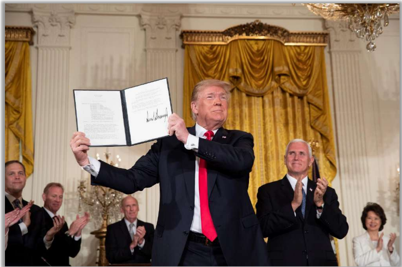
President Donald J. Trump signs Space Policy Directive 3 at the Third Meeting of the National Space Council in the East Room of the White House on June 18, 2018.

thousands. New technological advancements are not only increasing the number of American satellites, but prolonging the operational life of satellites already in orbit. Between February 25, 2020, and April 2, 2020, Northrop Grumman's Mission Extension Vehicle 1 became the first spacecraft to rendezvous with, service, and reposition another satellite to extend its useful life.