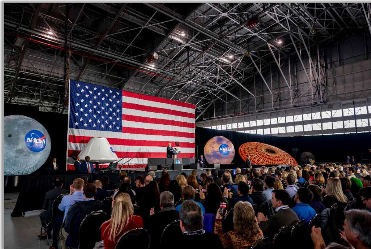
Vice President Mike Pence delivers remarks personnel and guests at NASA's Langley Research Center on February 19, 2020.

To preserve U.S. heritage in space, the Office of Science and Technology Policy issued a report on Protecting and Preserving Apollo Program Lunar Landing Sites and Artifacts in March 2018. This report outlines the global significance of the Apollo Program, and its cultural, scientific, and technological impact more than 50 years later and underlines the importance of the sites as a means to ensure this heritage is accessible to future generations. On July 20, 2019, people all around the globe commemorated humanity's first steps on another world during the celebrations surrounding the 50 th anniversary of the Apollo 11 lunar landing.