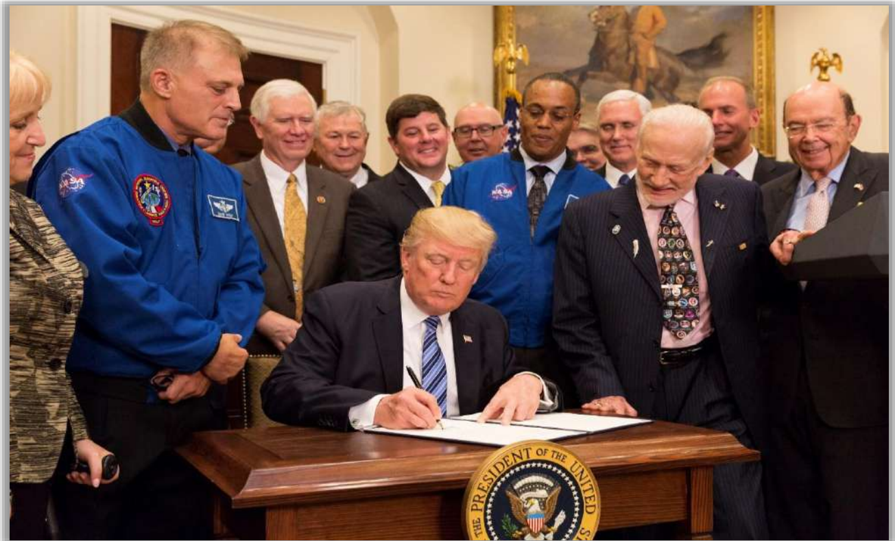
President Donald J. Trump signs Executive Order 13803, Reviving the National Space Council in the Roosevelt Room of the White House on June 30, 2017.