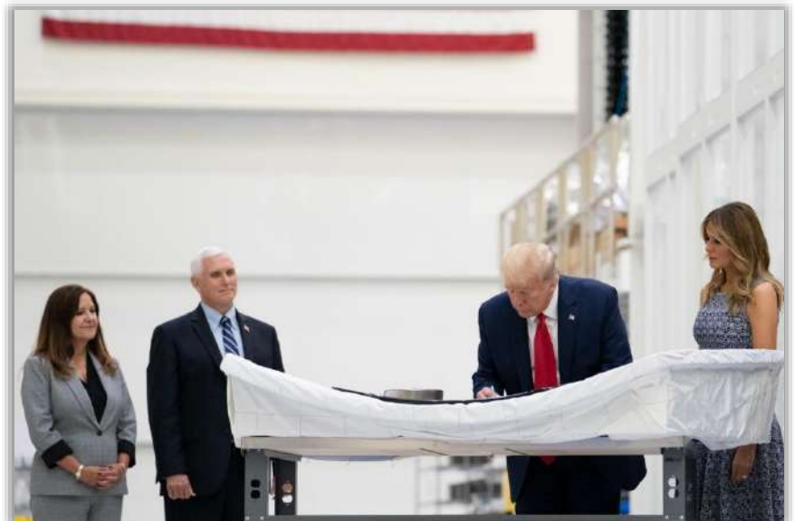
President Donald J. Trump, joined by First Lady Melania Trump, Vice President Mike Pence, and Second Lady Karen Pence, signs a panel from an Orion crew capsule during a tour of NASA’s Kennedy Space Center on May 27, 2020.

In order to be sustainable over the long term, U.S. efforts must align space policies, programs, and budgets with enduring national interests that span the political divide. Economic prosperity, national security, science, and foreign policy are all inherently affected by space activities, which provide both practical and symbolic benefits for the United States. The Trump Administration has prioritized national interests in the space domain in concert with core American values: democracy, freedom, the rule of law, and free markets. To advance U.S. national space power and make the world safer and more prosperous, American values must thrive on the next great frontier.