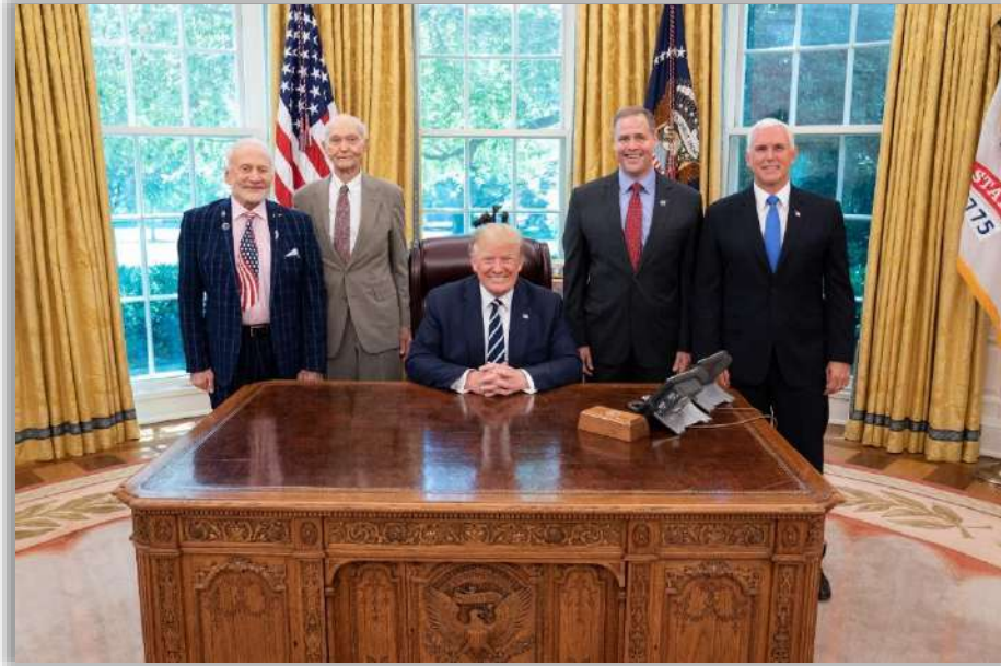
President Donald J. Trump, Vice President Mike Pence and NASA Administrator Jim Bridenstine welcome Apollo 11 astronauts Buzz Aldrin and Michael Collins in the Oval Office to commemorate the 50 th anniversary of the Apollo 11 Moon landing on July 19, 2019.