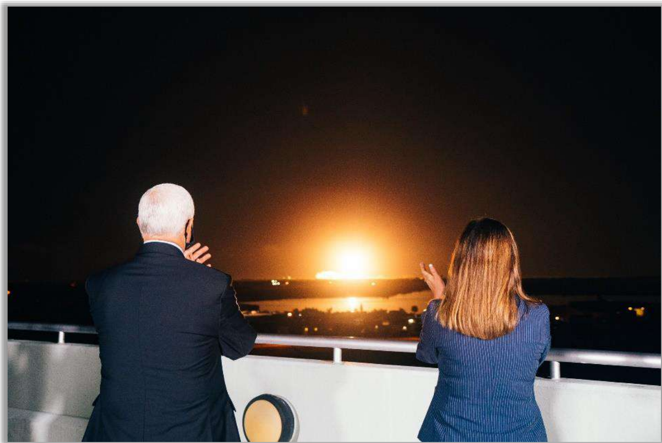
Vice President Mike Pence and Second Lady Karen Pence watch the launch of NASA's SpaceX Crew-1 Mission at NASA's Kennedy Space Center on November 15, 2020.