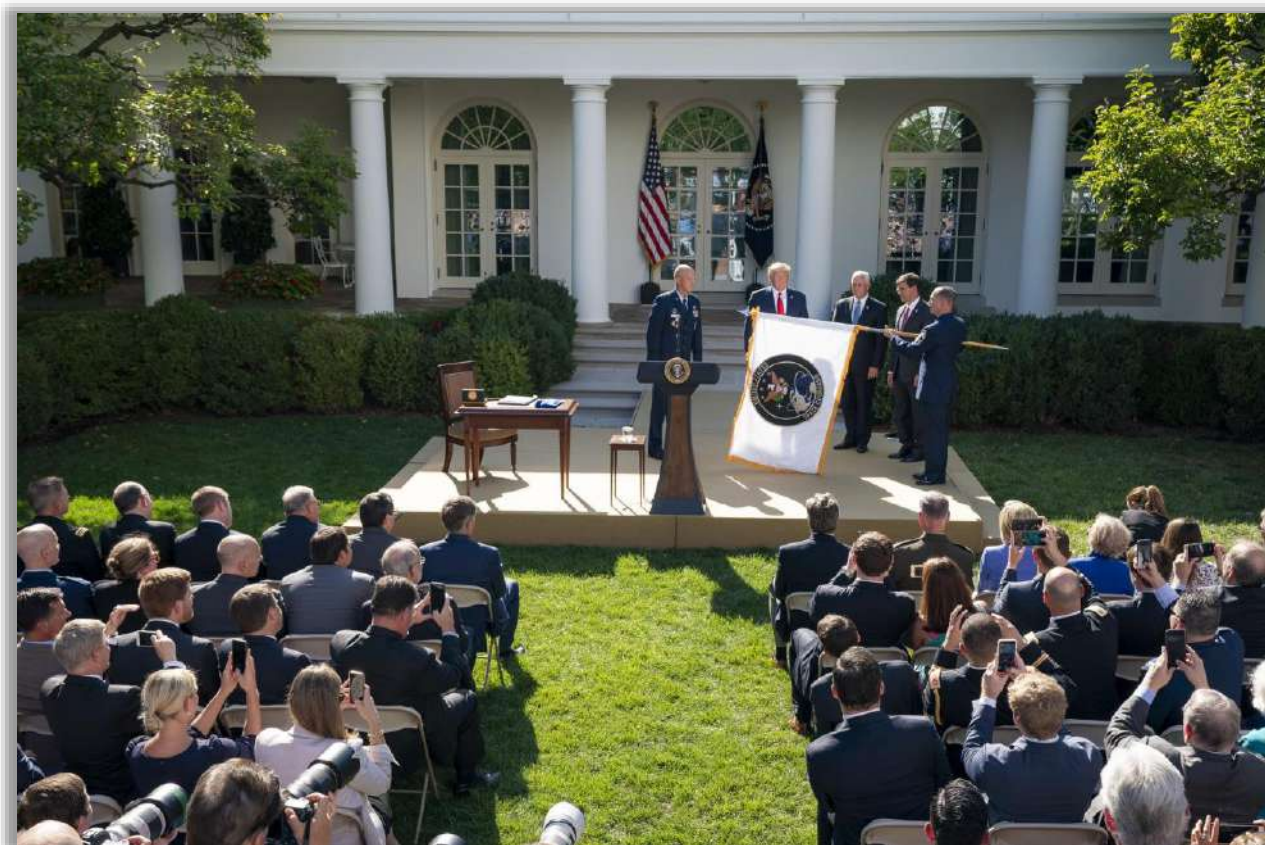
The flag of United States Space Command is unfurled during a ceremony in the Rose Garden at the White House on August 29, 2019.

The reestablishment of the United States Space Command as a Unified Combatant Command and the establishment of the United States Space Force as the sixth branch of the U.S. Armed Forces were significant efforts to effectively defend and protect American interests in all domains.