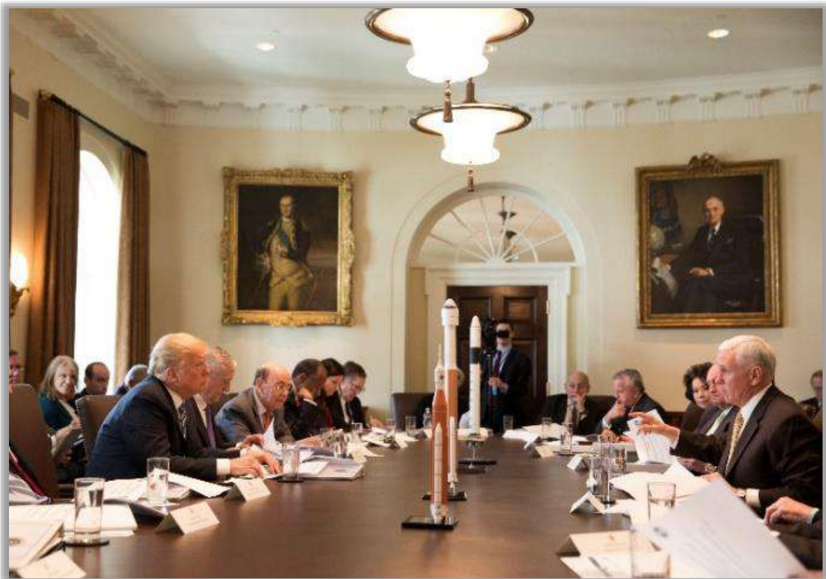
Vice President Mike Pence briefs President Donald J. Trump and members of the Cabinet in the Cabinet Room of the White House on March 8, 2018.