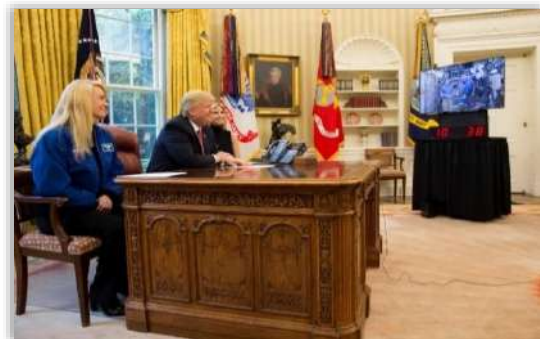
President Donald J. Trump, alongside Ivanka Trump and NASA astronaut Kate Rubins, speaks with NASA astronauts Peggy Whitson and Jack Fischer aboard the International Space Station, in the Oval Office on April 24, 2017, to congratulate Commander Whitson for breaking the record for most time in space of any American astronaut.

“Consistent with the overall goals of SPD-1, the United States will seek to land Americans on the Moon’s South Pole by 2024, establish a sustainable human presence on the Moon by 2028, and chart a future path for human Mars exploration. NASA’s lunar presence will focus on science, resource utilization, and risk reduction for future missions to Mars.”