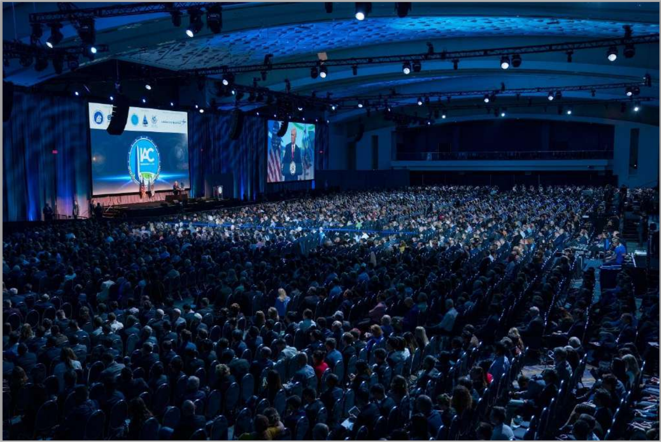
Vice President Mike Pence delivers remarks at the International Astronautical Conference at the Walter E. Washington Convention Center in Washington, D.C., on October 21, 2019.