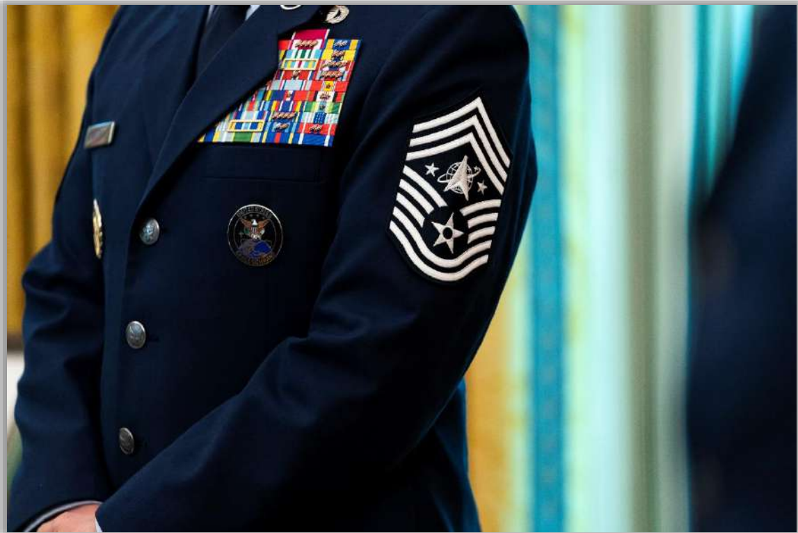
A close up view of the uniform of U.S. Space Force Senior Enlisted Advisor CMSgt Roger Towberman in the Oval Office on May 15, 2020.

On February 12, 2020, the President issued an Executive Order on Strengthening National Resilience through Responsible Use of Positioning, Navigation, and Timing Services. This order seeks to protect the national and economic security of the United States and its partners by ensuring reliable and efficient function of the Global Positioning System (GPS) and related critical infrastructure. The United States continues to make GPS services available worldwide as a free service, which has offered immense global value for communications, security, commerce, agriculture, transportation, mobility, weather, and emergency response. However, dependence on this invisible utility and its widespread adoption require protection from disruption and manipulation to ensure national resilience.