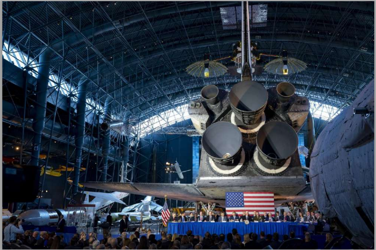
Vice President Mike Pence chairs the Sixth Meeting of the National Space Council at the Smithsonian National Air and Space Museum's Steven F. Udvar-Hazy Center in Chantilly, Virginia, on August 20, 2019.

The policy, program, and resource decisions of the Trump Administration have set the United States on a course to continue its global leadership in space exploration and discovery.