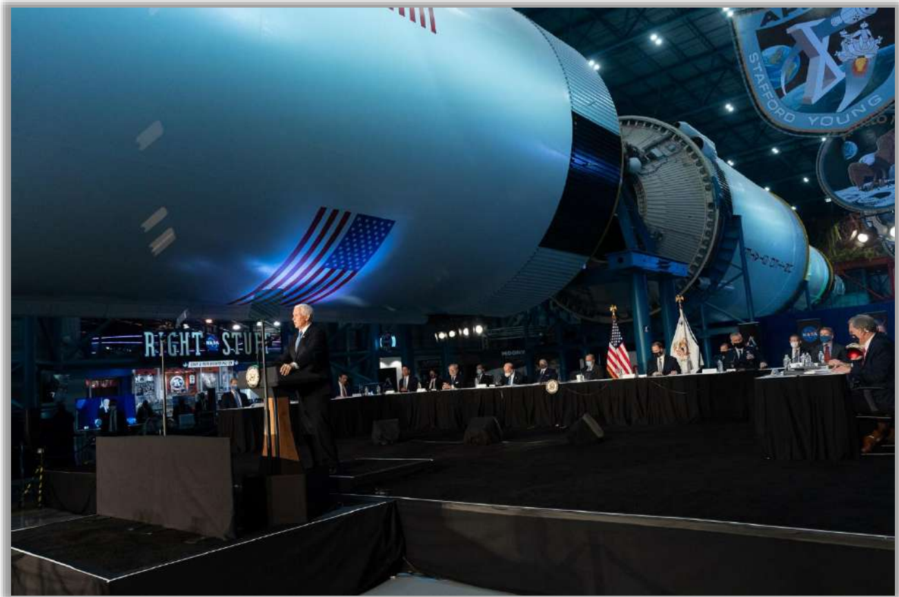
Vice President Mike Pence delivers remarks and chairs the Eighth Meeting of the National Space Council at NASA's Kennedy Space Center on December 9, 2020.