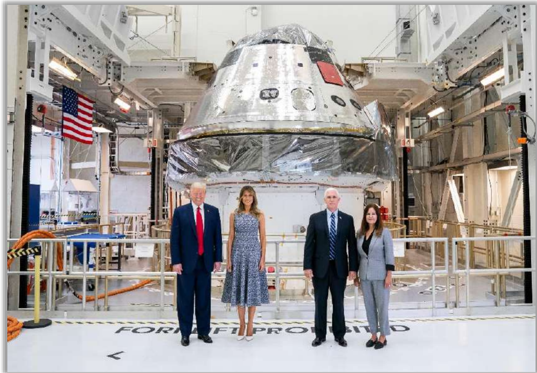
President Donald J. Trump, First Lady Melania Trump, Vice President Mike Pence, and Second Lady Karen Pence in front of the Orion capsule at NASA's Kennedy Space Center on May 27, 2020.

These bold goals were carried forward in the President's Budget Requests, which have resulted in some of the largest NASA budgets since the Apollo Program in the 1960s. Through the Artemis Program, NASA is developing its mission architecture, commercial and international partnerships, and budget requests to ensure the proper resources and programs are in place for sending humans to the surface of the Moon.