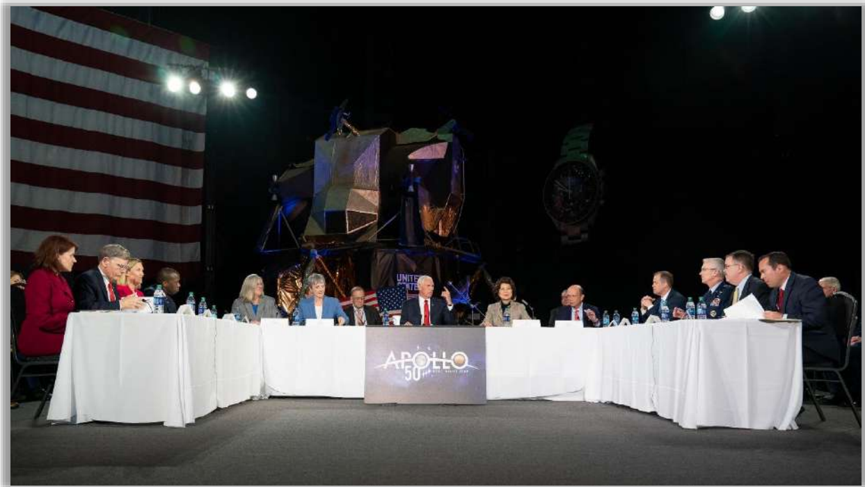
Vice President Mike Pence chairs the Fifth Meeting of the National Space Council at the U.S. Space and Rocket Center in Huntsville, Alabama, on March 26, 2019.

This recommendation paved the way for the first Space Policy Directive on December 11, 2017. Space Policy Directive 1 (SPD-1), Reinventing America's Human Space Exploration Program, states that the United States will: