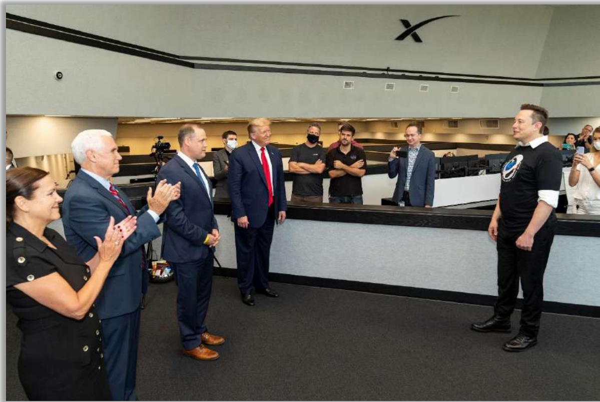
President Donald J. Trump, Vice President Mike Pence, Second Lady Karen Pence, and NASA Administrator Jim Bridenstine applaud SpaceX founder and CEO Elon Musk after the successful SpaceX Demonstration Mission 2 launch at NASA's Kennedy Space Center on Saturday, May 30, 2020.

In November 2020, NASA marked the twenty-year anniversary of continuous crewed operations on the International Space Station. Noting this remarkable achievement, prudent steps are being taken to prepare for the future of U.S. presence in low-Earth orbit once this national asset reaches its inevitable retirement. By harnessing American ingenuity and entrepreneurship, the United States is planning for a future that will involve multiple orbital platforms, at least some of which will be commercially operated. The United States foresees a future requirement for research, technology development, and crew training in low-Earth orbit, and is taking measures to increase commercial activity in this domain, which will allow the government to devote these resources to other critical exploration priorities.