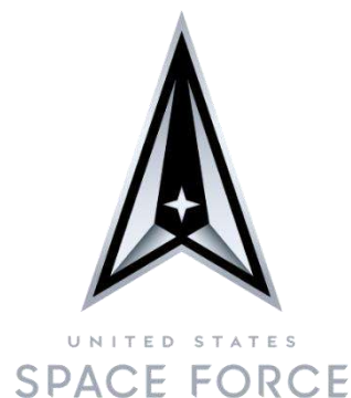
The official seal (L) and logo (R) of the United States Space Force.