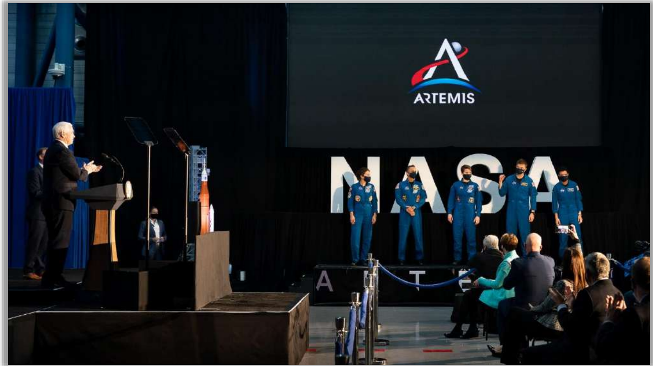
Vice President Mike Pence announces the names of the first cadre of astronauts for NASA's Artemis Program at NASA's Kennedy Space Center on December 9, 2020.