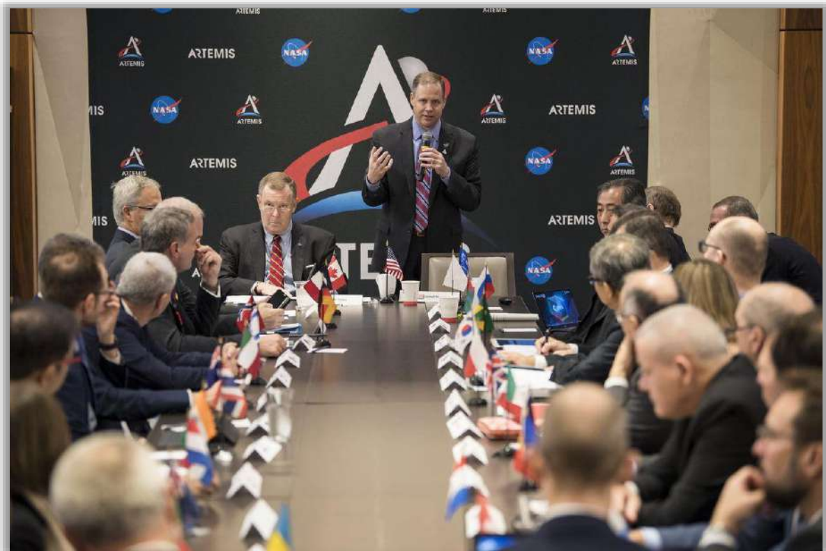
NASA Administrator Jim Bridenstine speaks with the heads of international space agencies at the 2019 International Astronautical Congress in Washington, D.C.

On July 27, 2020, officials from the Departments of State, Defense, and Energy, as well as the National Security Council, met with Russian Federation officials in Vienna, Austria, for a Space Security Exchange under the framework of the Strategic Security Dialogue, the first of its kind in seven years.