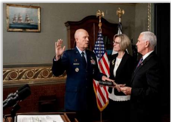
Vice President Mike Pence swears in General John W. “Jay” Raymond as the first Chief of Space Operations for the U.S. Space Force in the Vice President’s Ceremonial Office of the Eisenhower Executive Office Building at the White House on January 14, 2020.

develop advantages while U.S. interests in space are contested in this increasingly dynamic environment.