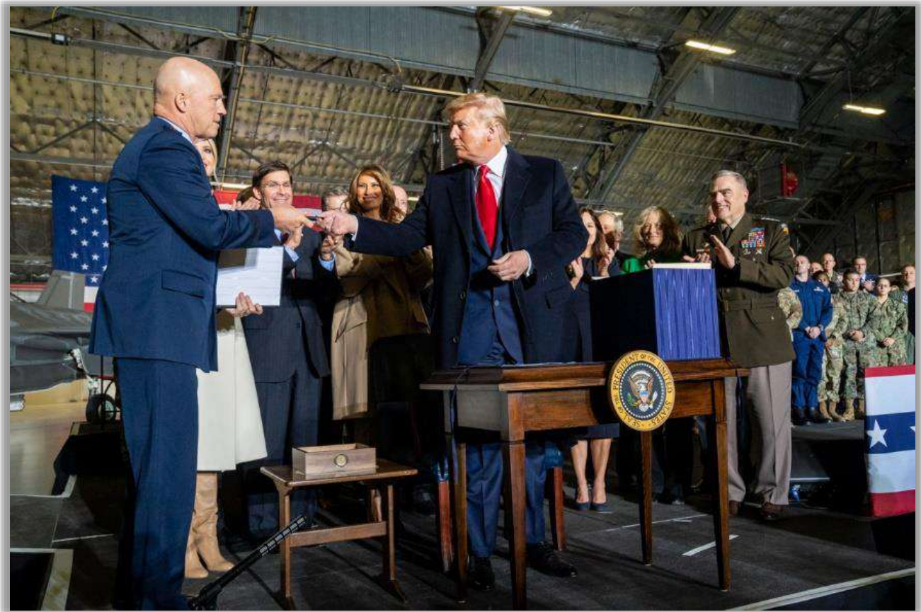
President Donald J. Trump greets General John W. “Jay” Raymond after signing the 2020 National Defense Authorization Act establishing the United States Space Force at Hangar 6 at Joint Base Andrews on December 20, 2019.