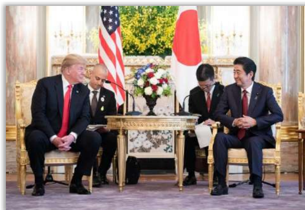
President Donald J. Trump participates in an expanded bilateral meeting with Japan's Prime Minister Shinzo Abe Monday at the Akasaka Palace in Tokyo on May 27, 2019.

On May 27, 2019, as part of the Japan-U.S. Summit in Tokyo, Prime Minister Shinzo Abe and President Donald J. Trump agreed to dramatically expand U.S.-Japan cooperation in human space exploration through the U.S.-led Artemis Program. The agreement was the culmination of years of increased cooperation between the United States and Japan in space science, space security, commercial space, and human spaceflight. On November 15, 2020, Japanese astronaut Soichi Noguchi became the first international member of NASA's Commercial Crew Program when he launched with American astronauts from Kennedy Space Center. On December 15, 2020, the United States and Japan signed an agreement to launch one hosted payload on Japan's Quasi-Zenith Satellite System. Finally, on December 28, 2020, the United States and Japan signed an agreement for cooperation on the Artemis Gateway.