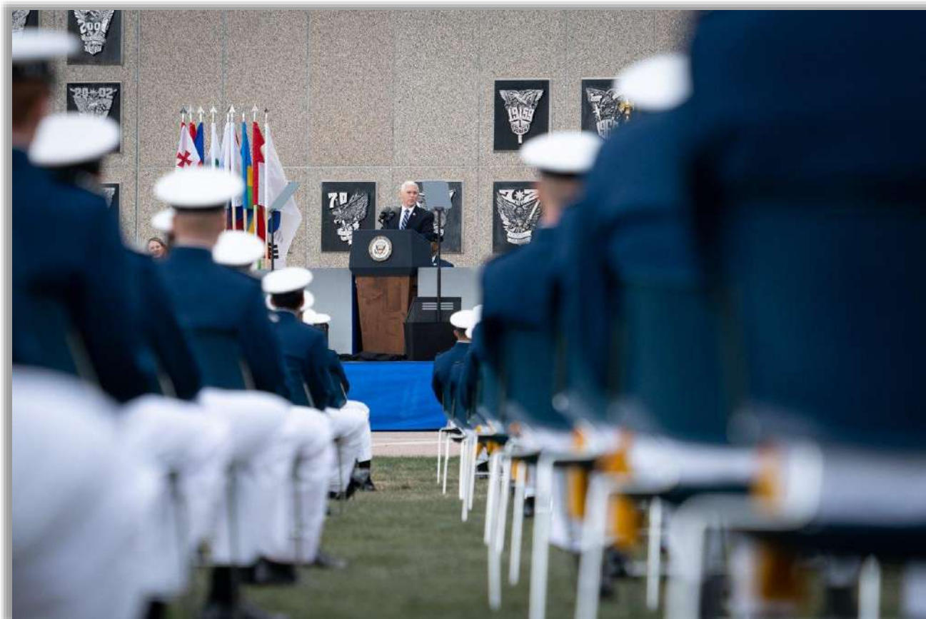
Vice President Mike Pence addresses the U.S. Air Force Academy at its 2020 commencement ceremony, which included the first graduates to be commissioned into the U.S. Space Force at the U.S. Air Force Academy on April 18, 2020.

On December 20, 2019, President Donald J. Trump signed the Fiscal Year 2020 National Defense Authorization Act, a historic piece of bipartisan legislation that formally created the United States Space Force to organize, train, and equip the Nation's space warfighters. The creation of the U.S. Space Force marks the first new military service since the establishment of the U.S. Air Force in 1947. The Administration continues to support the stand-up the U.S. Space Force, including advocating for space operations capabilities and sufficient appropriations, re-designating certain Air Force bases as Space Force bases, accessing and transferring personnel, and developing and implementing new cultural elements of the service.