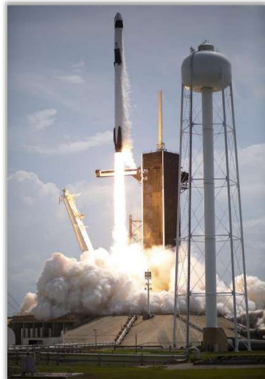
A SpaceX Falcon 9 rocket is launched from Launch Complex 39A for NASA's SpaceX Demo-2 mission to the International Space Station with NASA astronauts Robert Behnken and Douglas Hurley aboard at NASA's Kennedy Space Center on Saturday, May 30, 2020.

extension of U.S. presence from low-Earth orbit, a return to the Moon for a sustainable presence, and missions to Mars and beyond. The report lays out necessary steps to achieve a truly American future in space, recognizing that it is not merely American machines and astronauts that constitute U.S. space activities, but American values as well.