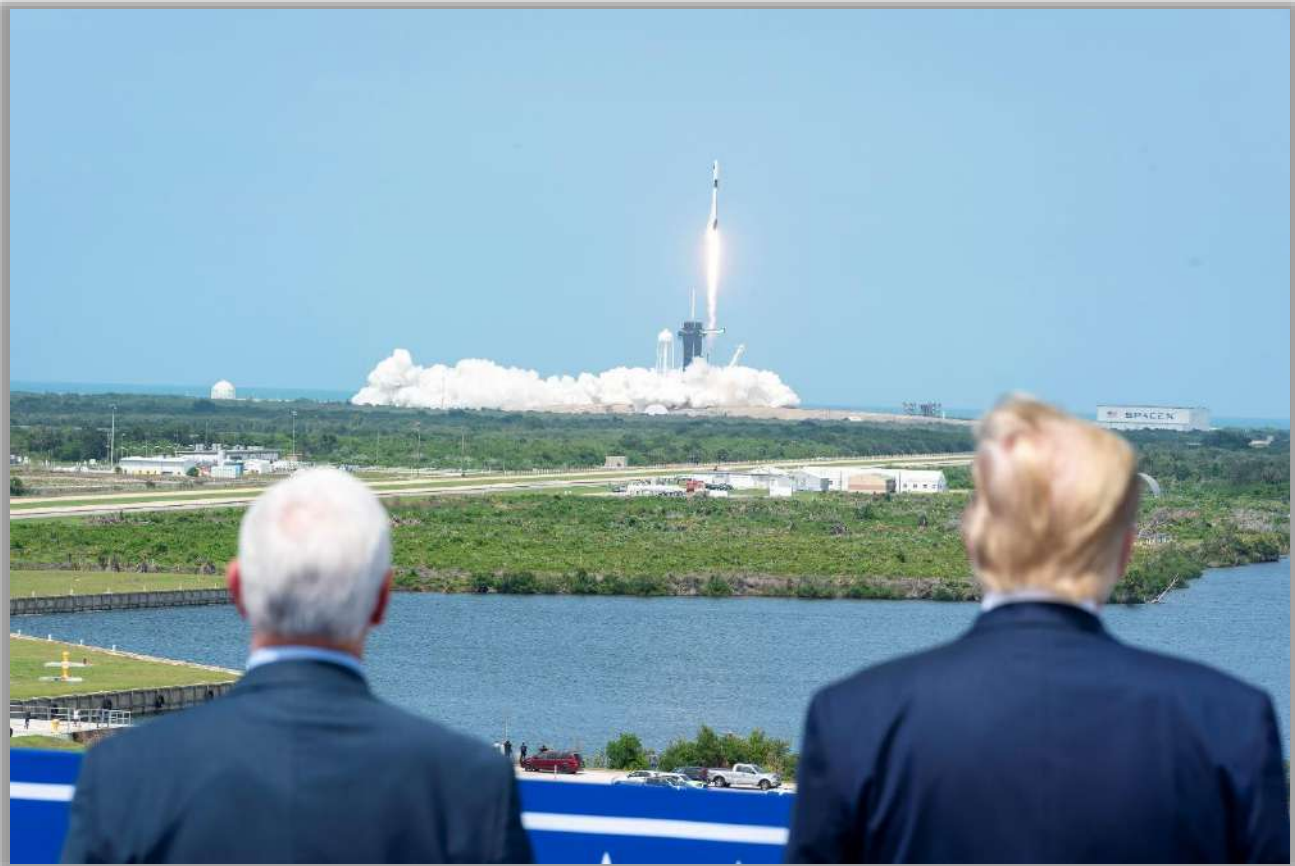
President Donald J. Trump and Vice President Mike Pence attend NASA's SpaceX Demonstration Mission 2 launch for the Commercial Crew Program at NASA's Kennedy Space Center on May 30, 2020.

“We are a nation of pioneers. We are the people who crossed the ocean, carved out a foothold on a vast continent, settled a great wilderness, and then set our eyes upon the stars. This is our history, and this is our destiny.”