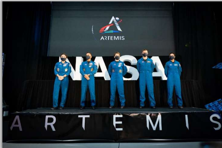
Five members of the first cadre of astronauts for NASA's Artemis Program are recognized after their names are announced by Vice President Mike Pence at NASA's Kennedy Space Center on December 9, 2020.