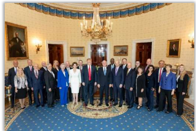
President Donald J. Trump and Vice President Mike Pence with members of the Users' Advisory Group on June 18, 2018, in the Blue Room of the White House.

The Council is supported by the Users' Advisory Group (UAG) , a Federal Advisory Committee composed of senior leaders and subject matter experts from industry, academia, and other non-federal entities representing the broader space community. Members of the UAG are appointed to two-year terms. The first members were appointed in June 2018. New appointments and re-appointments were made in June 2020. Since its first meeting on June 19, 2018, the UAG has regularly convened to provide valuable input to the National Space Council.