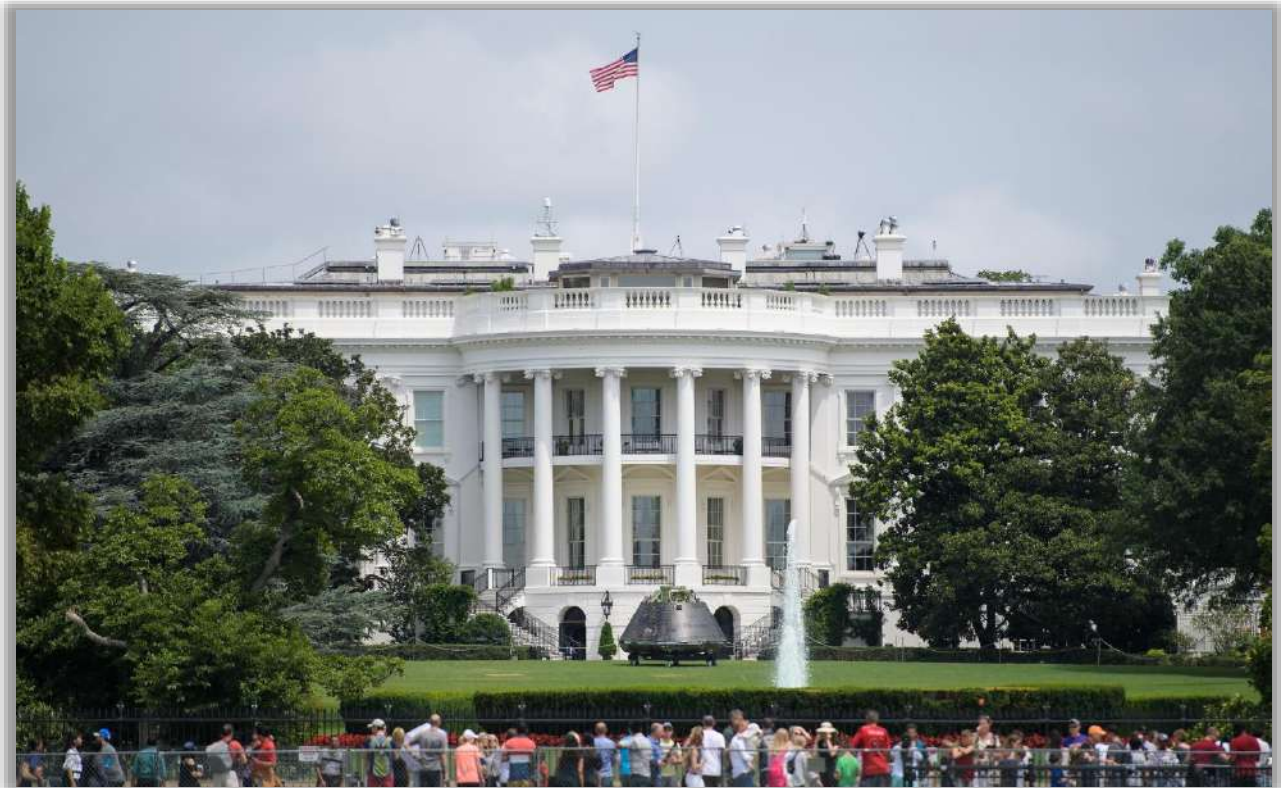
NASA's Orion spacecraft, produced by prime contractor Lockheed Martin, is seen on the South Lawn of the White House on July 22, 2018.